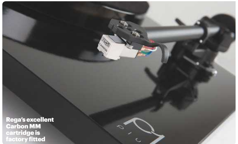
Rega's excellent Carbon MM cartridge is factory fitted

The Planar 1 Plus is similarly priced to the Audio-Technica AT-LP5 (HFC 415), which is also designed with a view to use in a fit-and-forget context. Out of the box in their shipped condition, the better phono stage and arm of the Rega are capable of a superior sonic performance. Where the LP5 hits back is that it is far easier to push the spec beyond what comes supplied. It is easy to change and accommodate a variety of cartridges, the phono stage can be switched out and it is unusually receptive to other tweaks and upgrades. If, however, you simply want to buy a turntable with great performance from the off, the Planar 1 Plus is the superior solution.